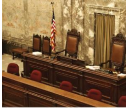
CRS Report for Congress: Broadband Internet Access and the Digital Divide: Federal Assistance Programs: April 8, 2003 - RL30719